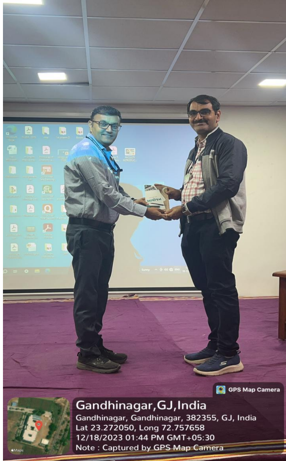
Gandhinagar, GJ, India Gandhinagar, Gandhinagar, 382355, GJ, India Lat 23.272050, Long 72.757658 12/18/2023 01:44 PM GMT+05:30 Note : Captured by GPS Map Camera